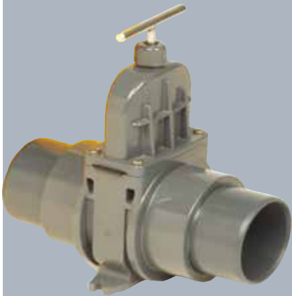
PVC inlet sluice valve DN 100 or DN 150, with pipe sockets bonded in, for the time-saving and space-saving direct connection to the inlet clamping flange.